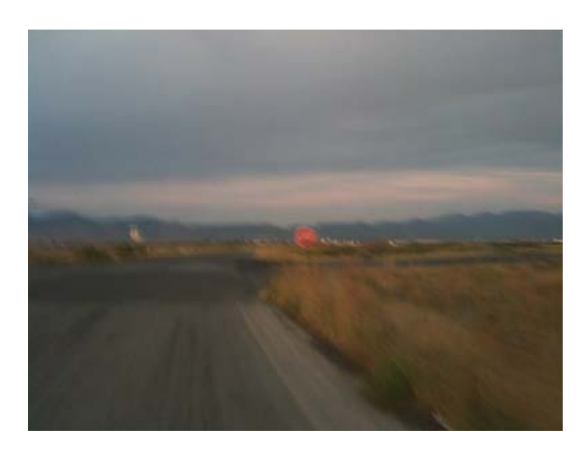
13. Saltair/N. Temple Frontage Road – this is chip sealed area to the east of the concrete area. See IMG 5423. The pavement is in decent shape here, but when it does get chip sealed again, there are