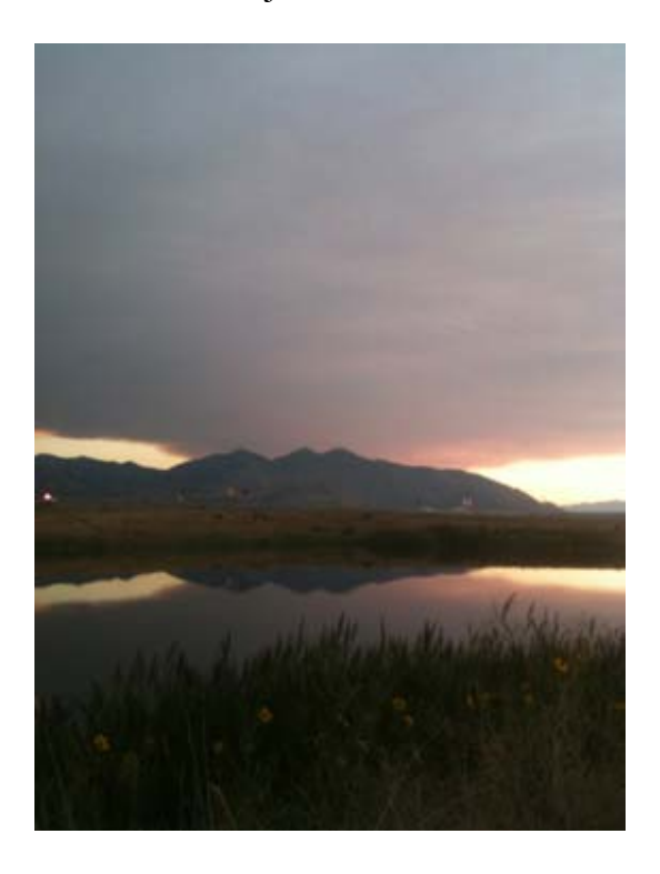
18. Water on the route:

17. IMG 5421 - just a cool view from the route.