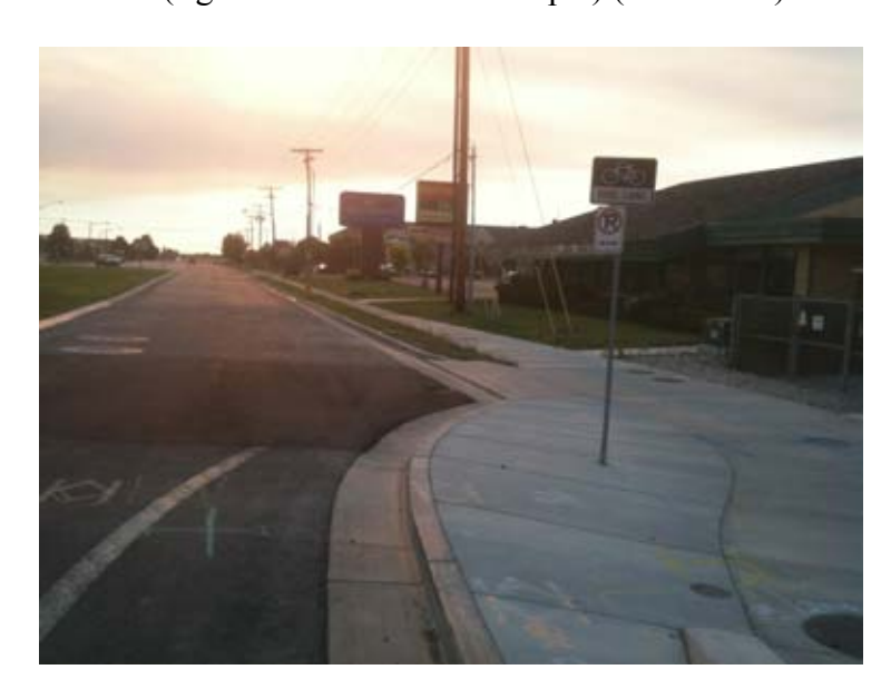
At 2200 West southbound, a sign is needed indicating the bike lane on N. temple is to the right.

Westbound, the bike lane abruptly ends, even though there's a sign indicating it continues at 2100 W (right exit onto old N. Temple) (IMG 5368)